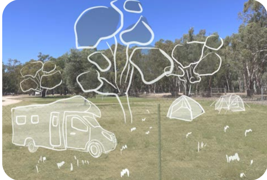
PUBLIC CAMPING AREA