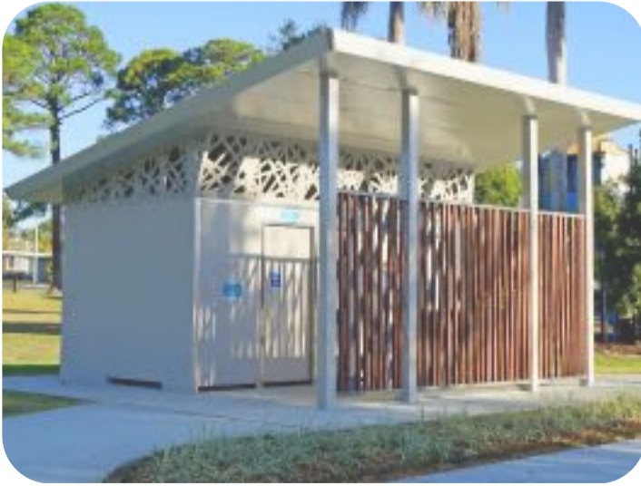
FUTURE TOILET BLOCK