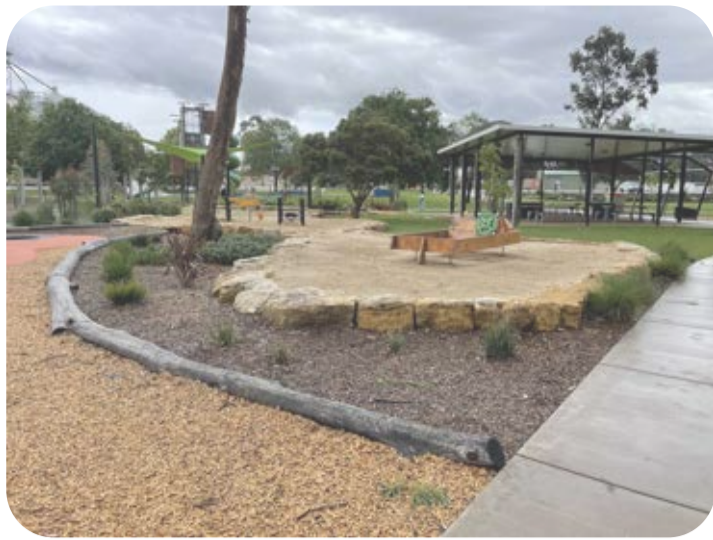
BBQ PRECINCT & PLAYSPACE