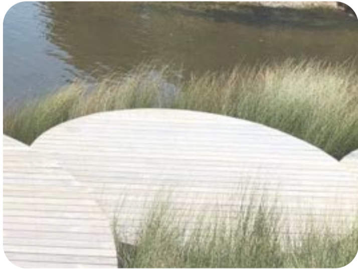
TIMBER LOOKOUT STRUCTURE