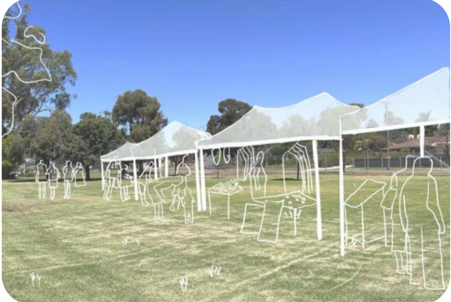
PROPOSED MIXED USE AREA