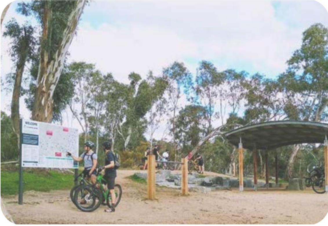
INFORMATION / GATHERING SPACE