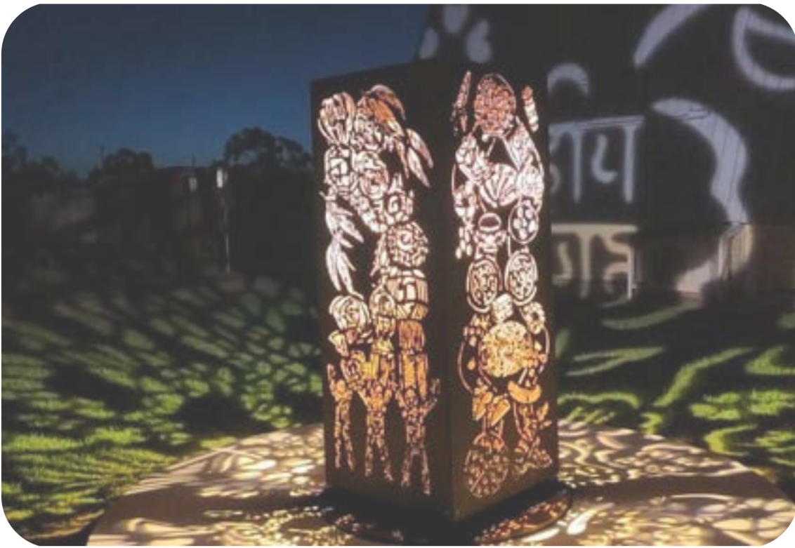
PUBLIC ART INSTALLATION